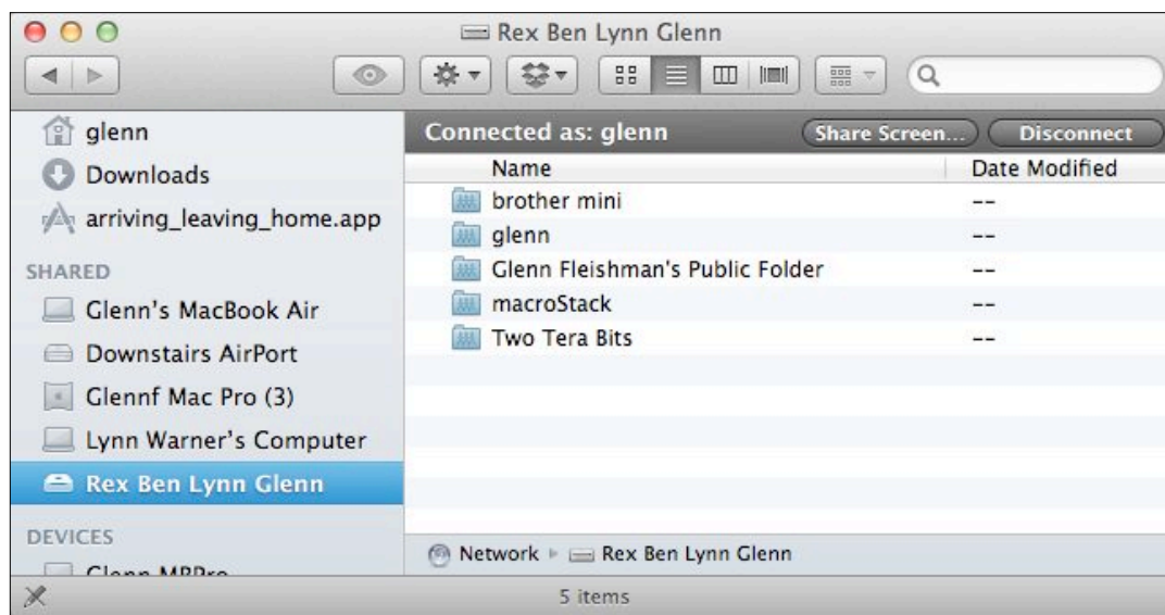
Figure 26: Click the Share Screen button for this Bonjour-networked computer—notice the name Rex Ben Lynn Glenn in the Shared list at the left.

To access a remote shared screen via Bonjour, open a Finder window and select a server (a remote computer) in the Shared section of the sidebar; if screen sharing is an option, the Share Screen button appears near the upper right ( Figure 26 ).