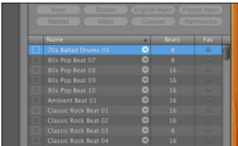
Figure 1: If many of your loops are grayed out and have little arrows next to them, you haven't yet downloaded the additional 1.2 GB of content. See the sidebar below for instruction on how to install the extra Apple Loops and Software Instruments.

Missing something? The default installation of GarageBand leaves out 1.2 GB of loops and Software Instruments. If you're missing loops (like in Figure 1 ) see the sidebar below for instructions on downloading the missing content.